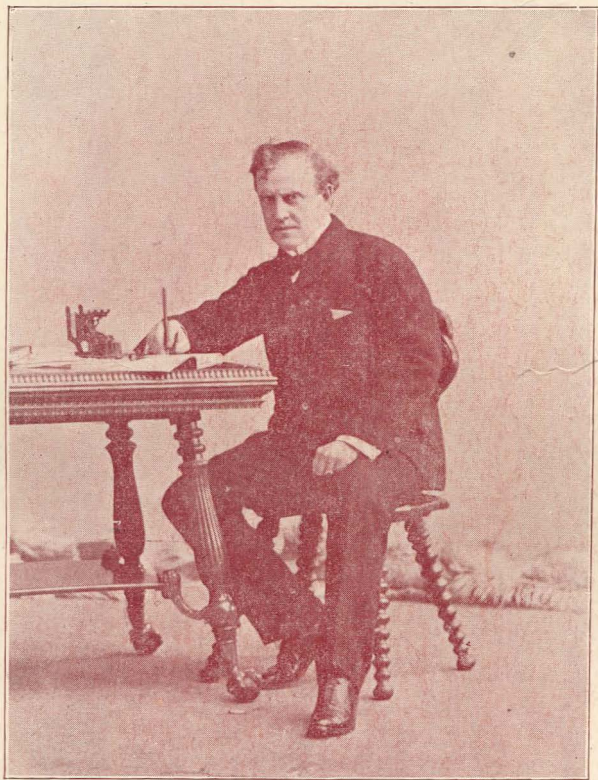
NAT C. GOODWIN