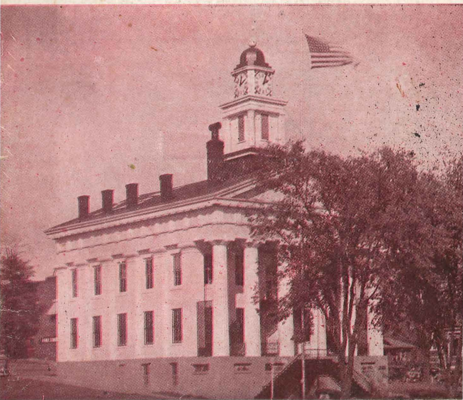
Orange County Court House

INITIATED BY PAOLI JUNIOR CHAMBER OF COMMERCE