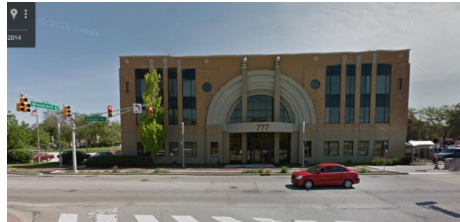
The intersection of Indiana Avenue and Blackford Street in Indianapolis

The state government is reportedly considering a partnership with Indiana University-Purdue University Indianapolis (IUPUI) to build the new Indiana State Archives on or near their campus. Pictured at right is one of the locations that is being considered - an area near the intersection of Indiana Avenue and Blackford Street.