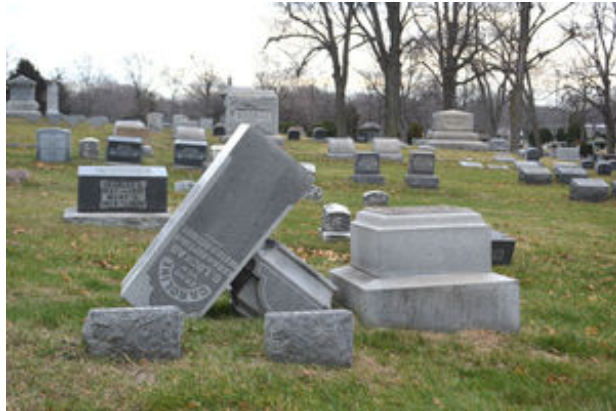
A toppled headstone at Greenwood Cemetery in Michigan City

Decatur Cemetery has been the target of repeated vandalism in recent weeks, including a guardian angel that was stolen from a child's headstone.