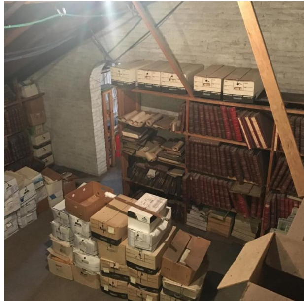
Records in the attic of the LaGrange County courthouse

Historical issues of some Columbus newspapers have been digitized and can be accessed through a subscription to Newspapers.com. The digitized issues include: Columbus Republican (1872-1927), Columbus Herald (1942-1993) and The Republic (1877-current).