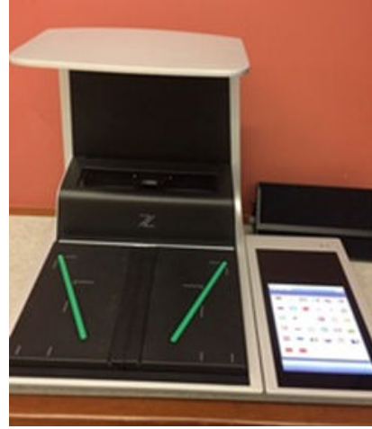
The Zeta overhead scanner

The benefit of an overhead scanner versus a traditional flatbed scanner is that you don't have to risk damaging your book or document to get it to lie flat.