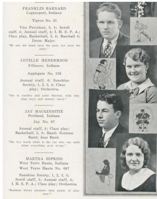
Senior year photos from Indiana Masonic Home High School in 1933 (see full-sized PDF )

The Indiana Masonic Home was founded in Franklin, Indiana in 1916 as a retirement home for members of Masonic lodges (today it's known as Indiana Masonic Home at Compass Park).