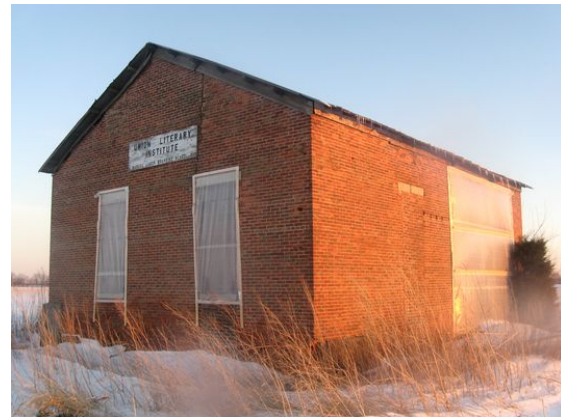
Union Literary Institute in Randolph County