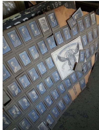
Photos of Spanish-American War veterans stored in Evansville's coliseum

Local historians are concerned with the disintegrating records and other artifacts stored in the Soldiers and Sailors Memorial Coliseum in Evansville. The coliseum was built in 1917 as a tribute to local Civil War and Spanish-American War veterans and over the years many veterans groups used it.