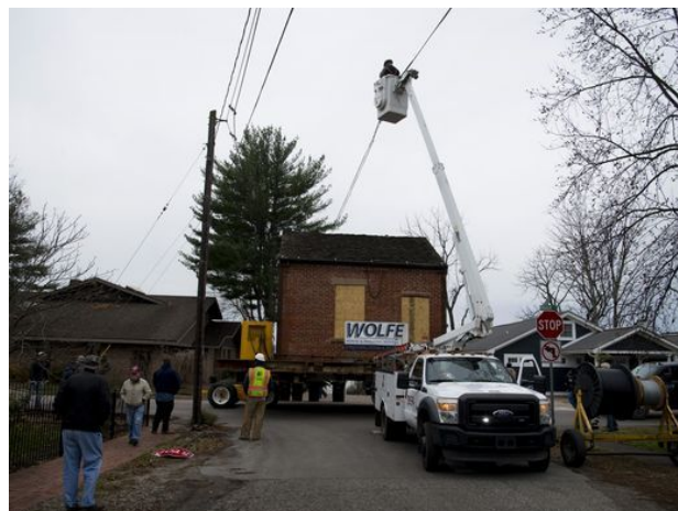
Moving the Little Red Brick House in Newburgh (photo courtesy Courier & Press ).

The Little Red Brick House in Newburgh was recently moved a mile away to the Old Lock and Dam Park, where it will be part of a complex of historic buildings. Historic Newburgh estimated the cost to move the building - which dates to the mid-1800's - was $70,000, which was partially funded by a grant from Indiana Historical Society.